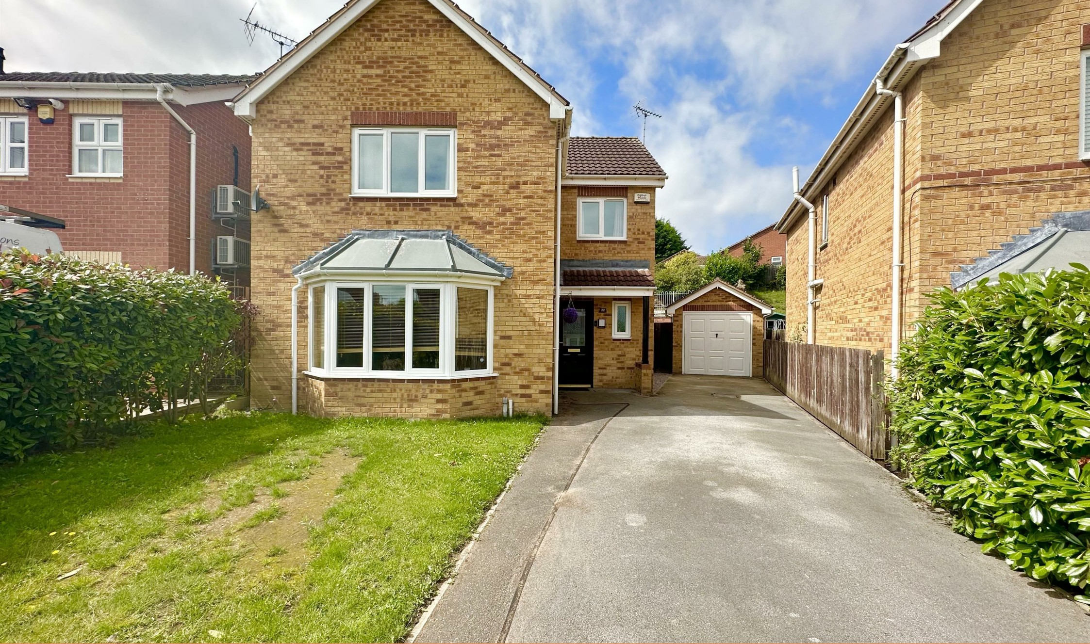
Siena Gardens, Forest Town Mansfield, Nottinghamshire, NG19 0RT